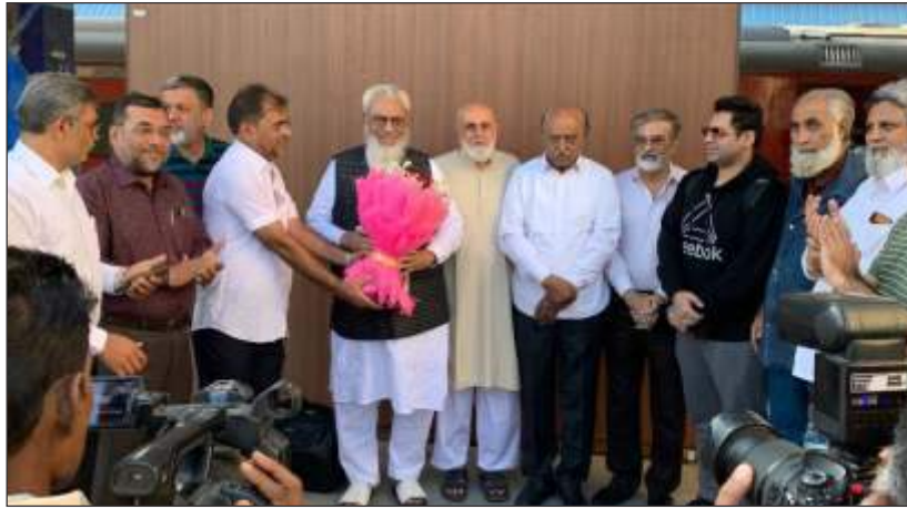
AIMJF delegates Warm welcome by Jalgaon Memon Jamat office bearers at Railway station