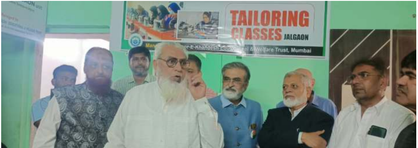
Visit to newly adopted Industrial Training Center from Noor-E- Khandesh Educational & Welfare Trust, Mumba of All India Memon Jamat Federation (AIMJF) by delegates in Jalgaon on 19th November 2022