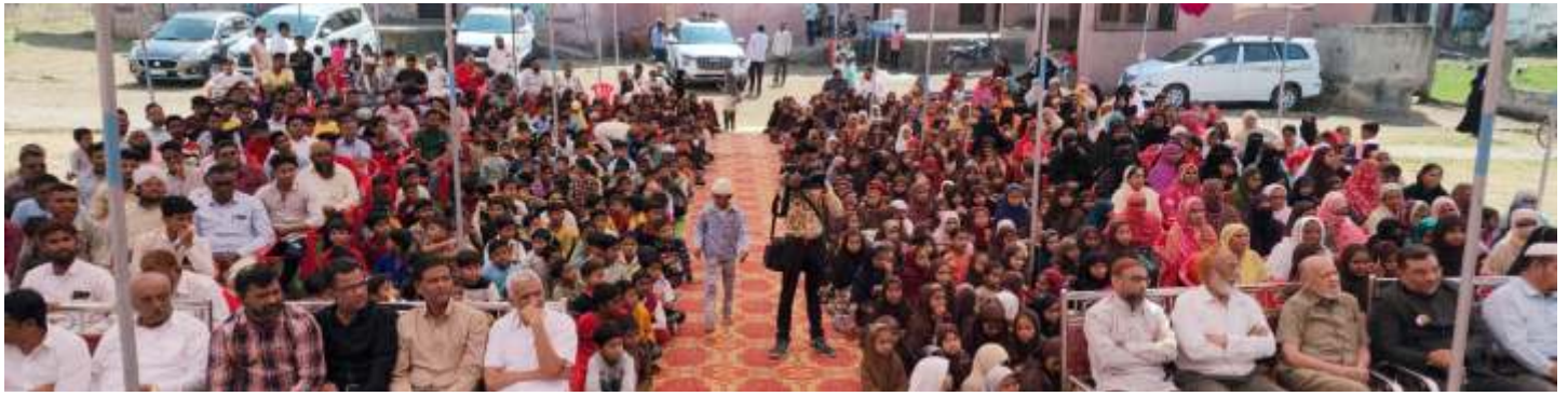
Huge number of Crowd of students and their parents at Jalgaon School inauguration ceremony