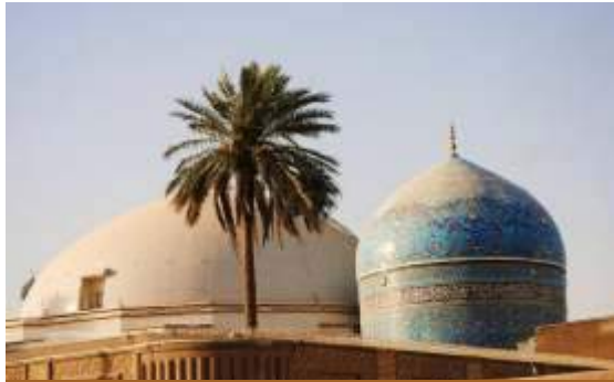
Blessed Mausoleum of Shaikh Mohiyuddin Abdul Qadir Jilani

The Descent of the Man to the Lowest of the Low: The purpose of the spirit's coming to this lowest of created realms is that it should seek to return to its previous closeness while in its actual form of flesh and bone: that it should come to this realm of coarse matter and, by means of the heart which is inside this corpse. plant the seed of unity and grow the tree of unity therein.. (The roots of that tree are where they have always been; its branches fill the void of bliss, and there, for the pleasure of Allah, bear the fruits of unity.) Then in the earth of the heart the spirit planted the seed of religion and wished to grow the tree of religion, in order to obtain fruits, each of which would raise it to levels closer to Allah.