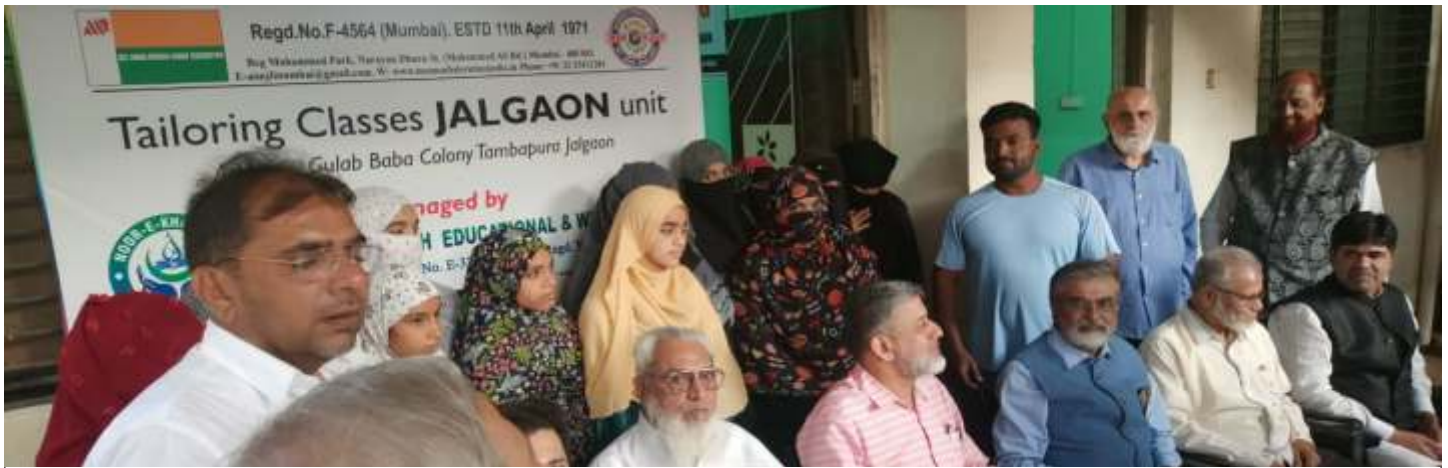
AIMJF delegates and Prominent personalities visit to Tailoring Class, Jalgaon Unit adopted by AIMJF from Noor -E- Khandesh Trust on 19th Nov.